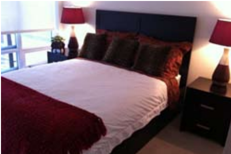
508 Herald Street, Victoria

Canoe Brewpub is located in an 1894 brick heritage building featuring the largest waterfront patio in Victoria. Canoe is known for brewing award winning handcrafted beer! Getting to Canoe can be half the fun; arrive harbor side via one of the city's popular Harbor Ferries direct to the Canoe dock!