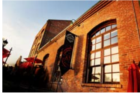
Canoe Brewpub 450 Swift Street, Victoria

Design District Studio Inc. offers our associates who are Interior Designers, Stagers, Architects and Graphic Designers a professional and elegant studio to utilize as their own personal work space. We also provide custom interior finishings to complete your home as well we consign original art by local artists.