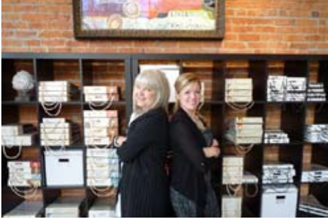
Design District Studio Inc. 1826 Government Street, Victoria