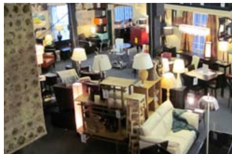
Capital Iron 1900 Store Street, Victoria

SOWOBO stands for Solid Wood Bedrooms Only. The sheer enjoyment of owning a real-wood bedroom suite is a feeling that can be experienced every day. Drop in and see some absolutely beautiful bedroom furniture. Maple, Oak, and other fine woods on display. Crafted in Canada, and designed for a lifetime. Sleep well.